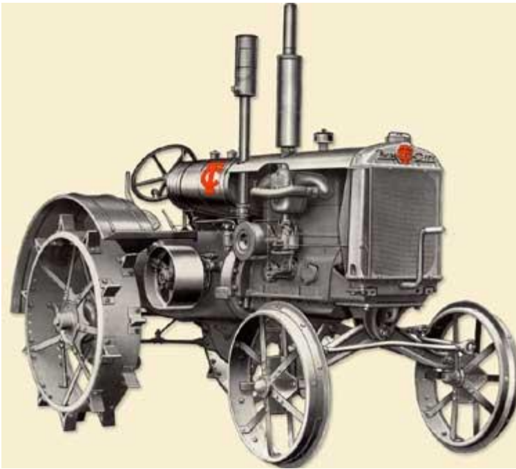
Figure 2 Lightweight Twin City Tractors of the 1920's.

MS&MC survived the Depression following the war, however, with all this hard-earned success; there was still one glaring omission. The company did not offer a line of tillage implements. In an effort to ensure their survival, and become a full line supplier, MS&MC organized a merger in the spring of 1929, blending inventory and tooling with Moline Plow Company and Minneapolis Threshing Machine Company to become Minneapolis Moline Power Implement Company. Minneapolis Moline assembled Twin City tractors from 1929 through 1938, labeling many of them as MM-Twin City.